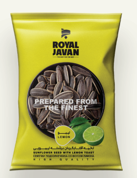
Lemon-Flavored Sunflower Seeds 100g