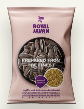
Roasted Sunflower Seeds