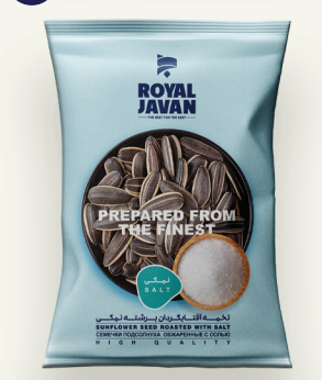
Salty Sunflower Seeds