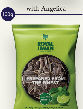
Sunflower Seeds with Mojito Flavor