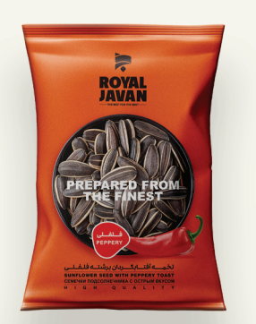
Spicy Sunflower Seeds 100g